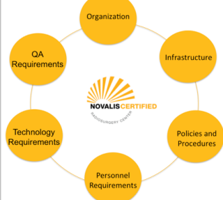
Figure 2. The certification program covers six broad areas, including institutional and program organization, infrastructure, policies & procedures, personnel, technology, and a comprehensive, well structured quality management program encompassing all aspects of quality assurance.

Novalis Certified is a vendor and equipment-neutral credentialing program emphasizes the implementation of SRS/SBRT as a well thought out process, encompassing organizational elements, infrastructure, well documented policies and procedures, personnel, technology and QA requirements. Clinical goals and quidelines should be developed for each disease site. All necessary resources, including personnel, expertise, technology, and time should be identified well in advance. Personnel qualifications include appropriate disease-site specific, equipment and vendor training, with license, board certification and maintenance of certification as appropriate. Written SRS/SBRT-specific roles and responsibilities for all program personnel. An SRS/SBRT credentialing process, and the use of checklists to guide all program aspects are strongly encouraged. Peer review processes, institutional and departmental quality management programs, and a strong commitment to safety (safety culture) are absolute imperatives.