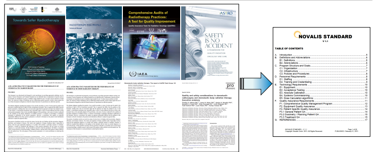
Figure 1. The Novalis Standard is based on international quality and safety documents, including those from the WHO, the IAEA, and ASTRO, and on SRS/SBRT-specific guidance documents from the ACR, ASTRO, AAPM and others

Methods: A standards document was drafted by a panel of experts from several disciplines, including medical physics, radiation oncology and neurosurgery. The document, based on national and international standards, covers requirements in program structure, personnel, training, clinical application, technology, quality management, and patient and equipment QA. The credentialing process was modeled after existing certification programs and includes an institution-generated self-study, extensive document review and an onsite audit. Reviewers generate a descriptive report, which is reviewed by a multidisciplinary expert panel. Outcomes of the review may include mandatory requirements and optional recommendations.