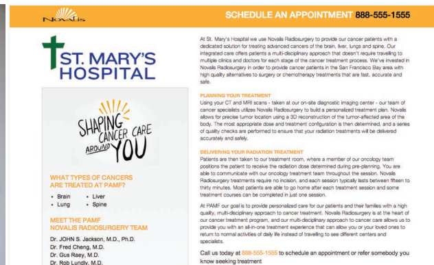
Dedicated landing page improves regional patient referral patterns