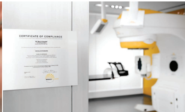
Independent certification of premium technical configuration